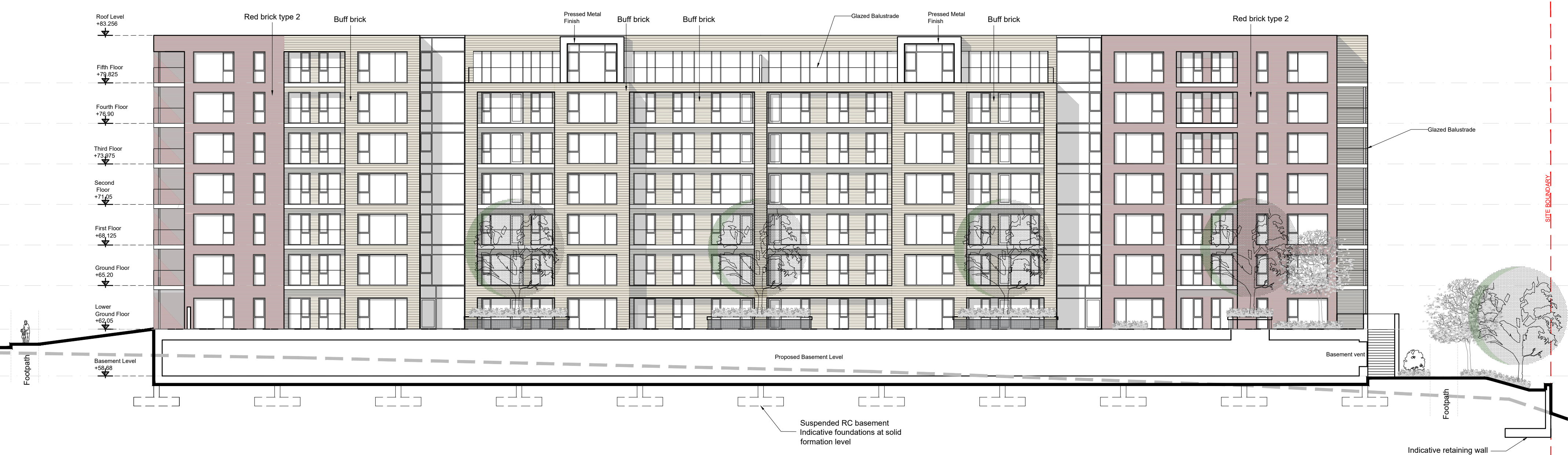
Block 2 South east elevation EE